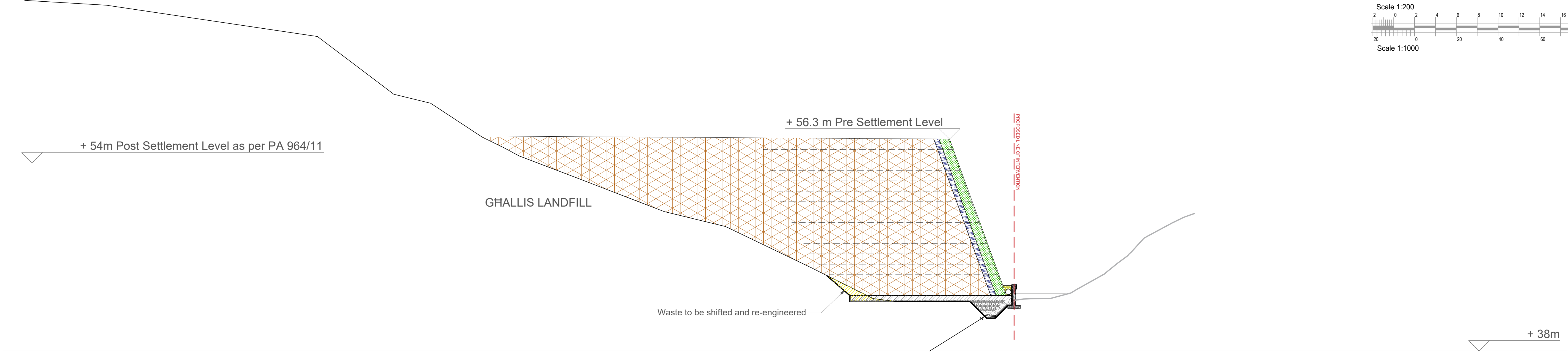
Proposed Section CC Scale 1:200 D02 003